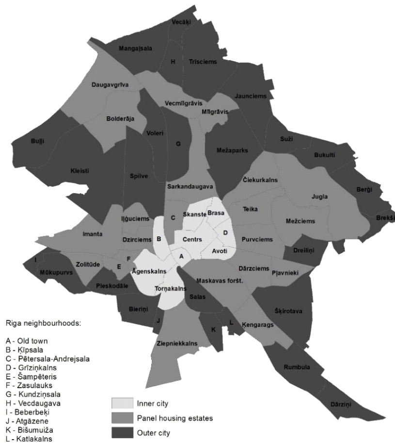
Figure 1. Map of neighbourhood units in Rīga divided into urban zones (authors' figure based on Riga City Council data)

Thus, 8012 residents in 2000 (1.25% of the total city population), and 5012 residents in 2011 (0.8%) were categorised as internal migrants to Rīga. Migration activity in the latter case was considerably lower due to the effects of the global economic crisis which resulted in higher international migration activity. In order to gain a better understanding, the neighbourhood residential patterns in the results chapter were studied using the division of Rīga into 3 distinctive urban zones (Figure 1) that are based on historical development and general patterns of built-up areas following the boundaries of neighbourhoods. Such division can be found in a great majority of cities in CEE (e.g. Sýkora 2009; Kovács and Herfert 2012). The zones are as follows: 1) inner city; 2) panel housing estates; 3) outer city.